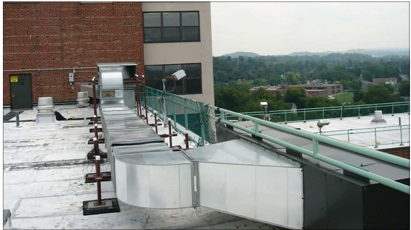
Left: The energy-saving panels were installed on one of the courtyard walls of the eleven-story apartment building.