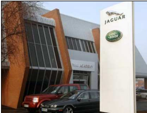
The front entrance of the Jaguar / Land Rover Academy in the United Kingdom