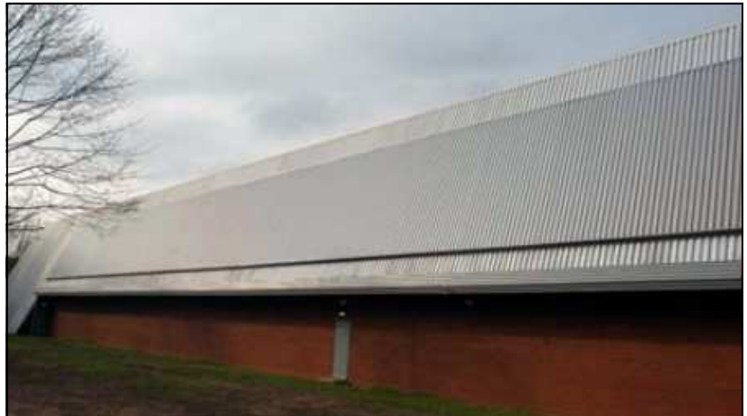
The grey SolarWall® solar air heating system integrated into the southern façade.