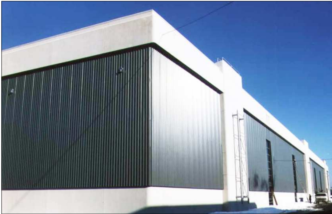
The blue-grey SolarWall® panels were selected by the architect to be a dramatic contrast with the white colored canopy at Bombardier's Canadair facility in Montreal, Canada.